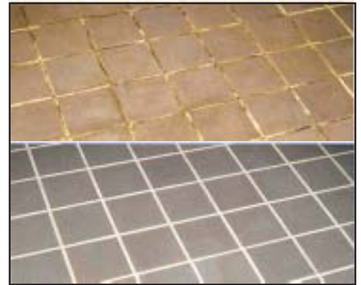
Microbial Cleaner Effectiveness

Cleaning products and chemical solvents containing hazardous compounds are widely used at Navy installations for a variety of operations, including component/equipment cleaning, facilities/workspace cleaning, degreasing, parts washing, and vehicle/equipment maintenance. Microbial/bioremediating products are now available to clean surfaces contaminated by oils, greases, fats, and other hydrocarbon substances. Cultures of microorganisms (microbes) remain dormant in the cleaning solution until it is mixed with water and exposed to the hydrocarbon contaminant. The microbes remediate the contaminants naturally by breaking them down into the harmless by-products of carbon dioxide and water. When the hydrocarbon products have been removed, the microbes ingest each other until the water supply is exhausted and they return to the dormant state. These products may be used in industrial locations where oils, greases, and hydrocarbons may be present, such as concrete shop floors, workspace benches, food handling and preparation surfaces, parking lots, and other equipment/component surfaces. Effectiveness of one microbial cleaning product was successfully demonstrated at Naval Station Mayport. Microbial cleaning products are available from commercial vendors.